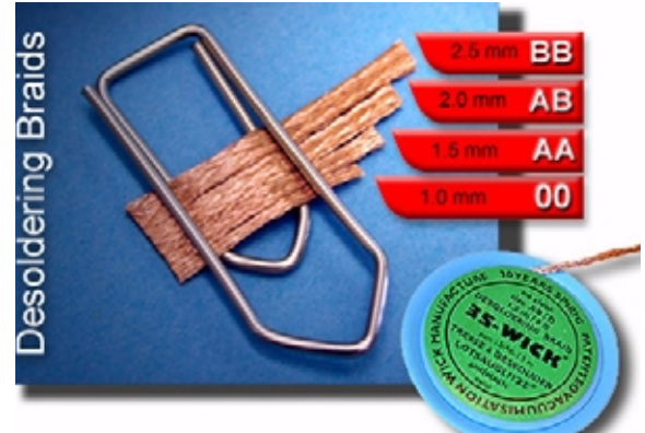
Spirig - Patents in USA 4,078,714; 4,081,575; 4,133,291; 4,164,606; Great-Britain 1,513,496; 1,546,601, 1,546,602; Japan 1,608,603; Europe 102,426; 47,579; Germany 3,274,430; 3,164,159; Switzerland 102,426 and in more countries issued or pending.

More information and a detailed price comparison of desoldering braids on www.desolder.com